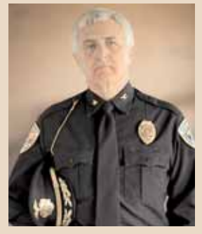
Peter Gallagher, Director of the East Grand Rapids Department of Public Safety

During the three dialogue sessions, two police officers from East Grand Rapids were surprised to learn that their city, which is viewed as being primarily white and wealthy, was also viewed by people of color as being unwelcoming. In fact, many people of color believe that they will be followed in East Grand Rapids stores or pulled over by its police force for nothing more than "looking as though they don't belong."